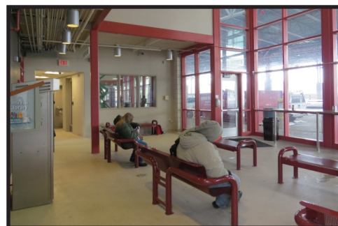
The remodeled Transit Center lobby.

Thank you for your patience during all phases of this remodel project!