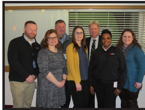
Representatives from CityLink were invited to attend a press conference on Feb. 20 announcing the recipients of funding from this settlement.

The bus purchased with the funding from this settlement will be one of three battery-electric Proterra buses CityLink expects to be delivered in summer 2021. The three new battery-electric Proterra buses will replace three aging diesel-engine buses in CityLink's active fleet of 53 fixed route buses.